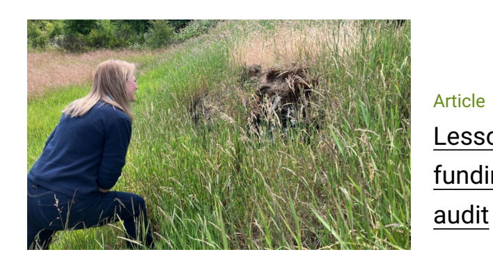
Article Lessons on Justice40 and federal grant funding from the EPA's Brownfields Program