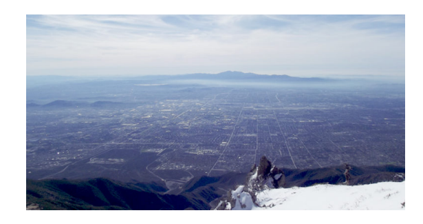
Nestlé Waters --- California

Geothermal system design and construction enables Boston's largest fossil-fuel-free building