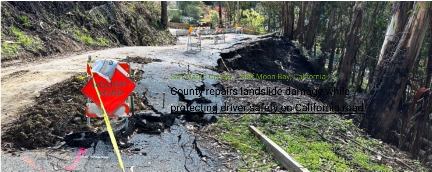
San Mateo County – Half Moon Bay, California County repairs landslide damage while protecting driver safety on California road