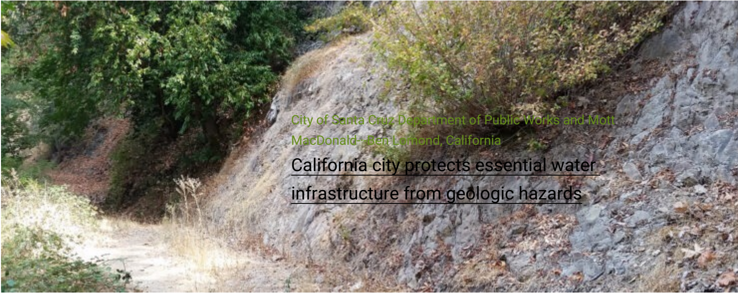
City of Santa Cruz Department of Public Works and Mott MacDonald – Ben Lomond, California California city protects essential water infrastructure from geologic hazards